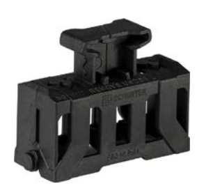
ESO_10.3x38 Fuse Inserter/Extractor with Cover Function for 10.3x38 mm Fuses in Clips, Patent Pending